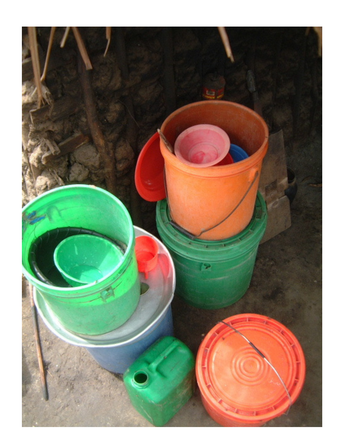
The clean kitchen