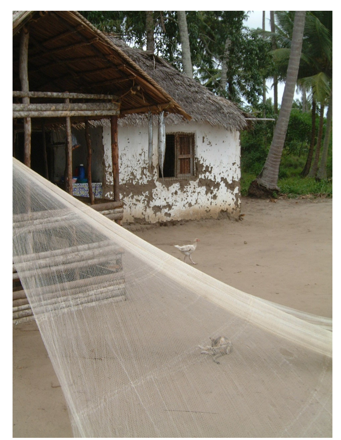
House, hanging fish & fishing net